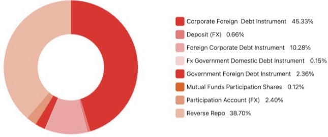
Current Fund Allocation Ratio