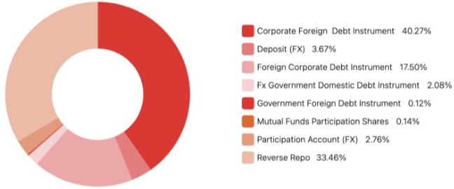
Current Fund Allocation Ratio